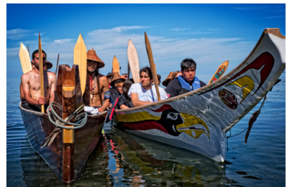
Coast Salish Canoe Journey 2018