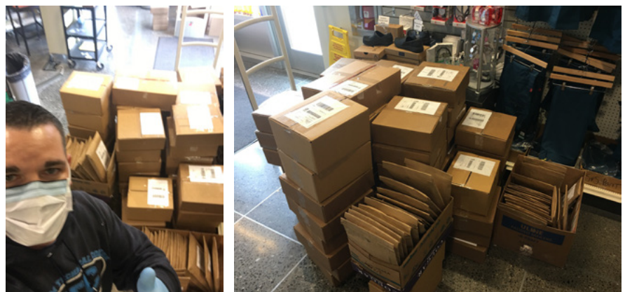
Image depicts a typical day's shipment ready for FedEx.