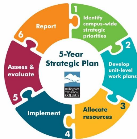
Figure 1. BTC's Draft Institutional Effectiveness Cycle

Since Spring 2016, the college has established a new participatory governance structure consisting of an overarching College Assembly and eight additional cross-constituency governance committees (see Introduction for a list of committees, and Appendix A for a brief description of each committee). The Planning and Resource Allocation (PARA) Committee, which is one of these new governance committees, will further develop the draft model and process described above and recommend a college-wide process to College Assembly during the 2017-18 academic year.